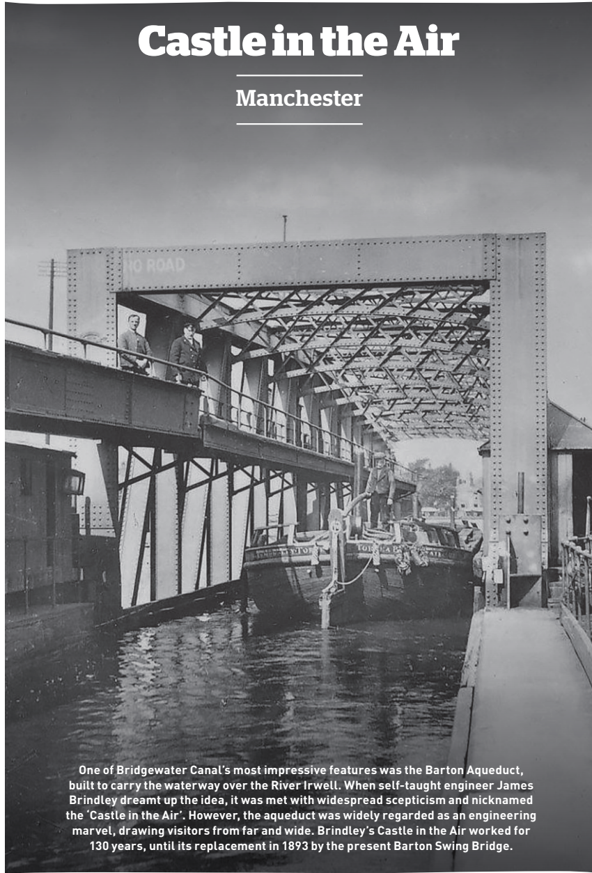
One of Bridgewater Canal's most impressive features was the Barton Aqueduct, built to carry the waterway over the River Irwell. When self-taught engineer James Brindley dreamt up the idea, it was met with widespread scepticism and nicknamed the 'Castle in the Air'. However, the aqueduct was widely regarded as an engineering marvel, drawing visitors from far and wide. Brindley's Castle in the Air worked for 130 years, until its replacement in 1893 by the present Barton Swing Bridge.

Main menu 11.30am – 11pm. Children's menu available.