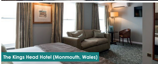
The Kings Head Hotel (Monmouth, Wales)